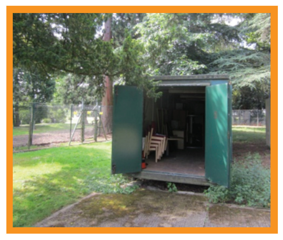
NIBSC has a Very Small Storage Area for Surplus Items

NIBSC is the global leader in the field of biological standardisation and control, responsible for the development and production of over 90% of the International Standards in use around the world to assure the quality of biological medicines.